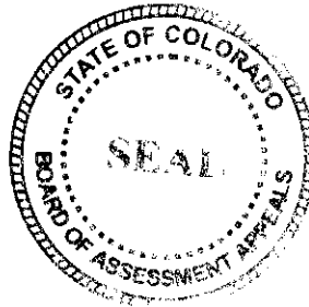
Toni Rigirozzi Toni Rigirozzi