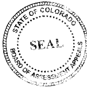
Toni Rigirozzi Toni Rigirozzi