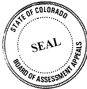
Penny S Bunnell Penny S Bunnell